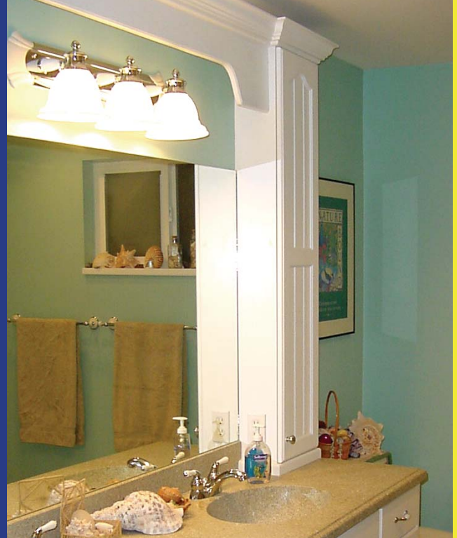
Large 2-basin country bath. Coordinated chrome and porcelain fixtures. This spacious bath was created from 2 cramped bathrooms.

"It makes me tired and discouraged just to think about remodeling my bathroom. Can 3 Day Kitchen & Bath make it easier for me?"