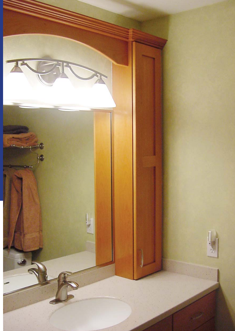
Alder Wood Shaker Style Cabinetry, Solid Surface Countertops with integrated vanity bowl.

Answer: "Mixing woods is perfectly acceptable. Whether you want an eclectic look or a more traditional kitchen, intermingling different woods and textures adds interest and beauty to your new room."