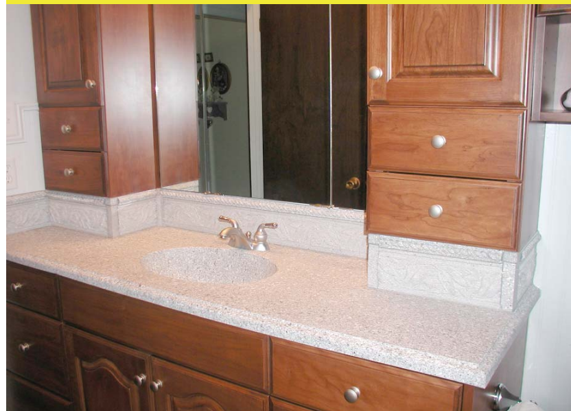
Cinnamon on Alder Cabinetry, "Travertine" Aggregate Countertops with matching integrated vanity bowl.

Answer: "Everyone we hire is the cream of the crop, and they have to meet our exclusive "Grandma Test." That means they have to be highly skilled craftsmen of unquestioned integrity who are so well groomed, well mannered, and well spoken that your grandma would be happy to have them as house guests for 3 days!"