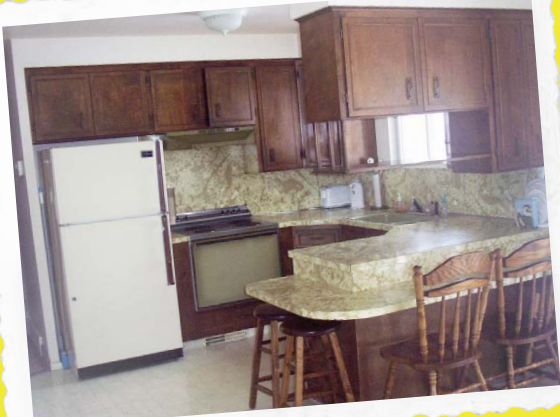
Scary Kitchen Before

A complete dream kitchen... top quality...top to bottom... floor to ceiling...in just 3 days! That's the magic of 3 Day Kitchen and Bath!