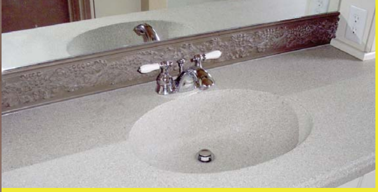
French Country Style Bathroom. Rustic Buttercream on Beadboard Alder Cabinetry, "Oregon Coast" Aggregate Countertops with matching integrated vanity bowl, Nickel Grape Leaf Backsplash.

"The other night we had a large gathering with 38 people in attendance. My new kitchen design facilitated the feeding of that many people. On top of that it with the new design and materials it was so easy to clean up afterward."