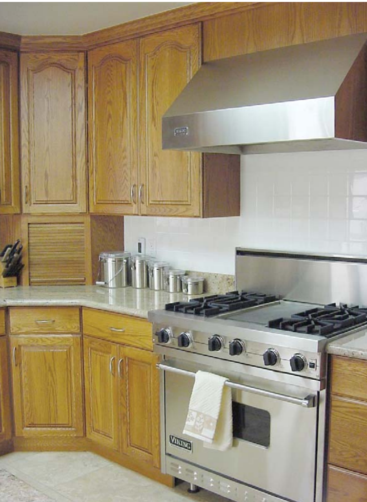
Upscale "Gourmet Kitchen". Medium Walnut on Oak Cabinetry, Granite Countertops, Travertine Floor.

And re-facing alone does not solve the problem of broken, worn or sticky rollers and mechanisms on drawers. Another huge benefit of all new cabinets and drawers, is that we can make them deeper, larger and more functional than your current ones."